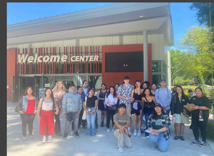
Lanzamiento Transfer Center Information